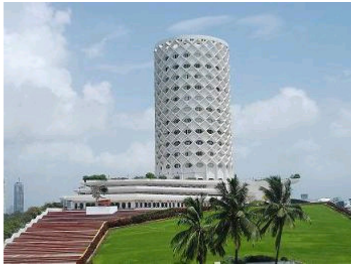
Fig. 3: Photograph of Nehru Centre (NC), Mumbai, India (A number of presentation Halls, Auditoria, Exhibition area, etc are available in this convention centre)